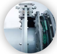
Rotary Kiln Sealing System DR0: Lowest emission sealing system in the market