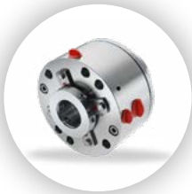
H75A4-B: Pump seal for use in H 2 , CCUS or for applications in the circular economy