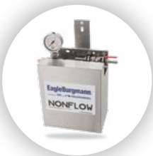
NonFlow: Seal supply system for minimum water consumption and maximum reliability