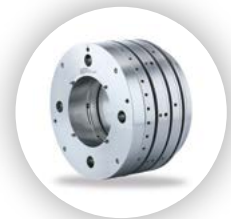
CobaDGS: Zero-methane emission DGS for compressors