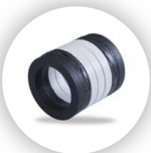
High-performance gaskets and packings for demanding tasks in renewable energy applications