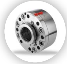
sCO 2 DGS: For use in supercritical CO 2 applications, such as CCUS or power generation