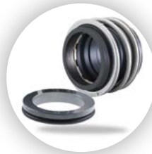
eMG1: Pump seal with outstanding lifespan thanks to its special design and materials