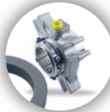
eCartex: Robust DiamondFace technology in standard cartridge seals