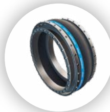
eFlexgen Expansion Joint: Innovative material and design for minimal fugitive emissions