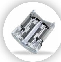
eMAK: Hermetically tight magnetic coupling with best-in-class energy efficiency