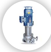
RoTechBooster: Seal gas booster for compressors to avoid venting during turning and stand-still mode